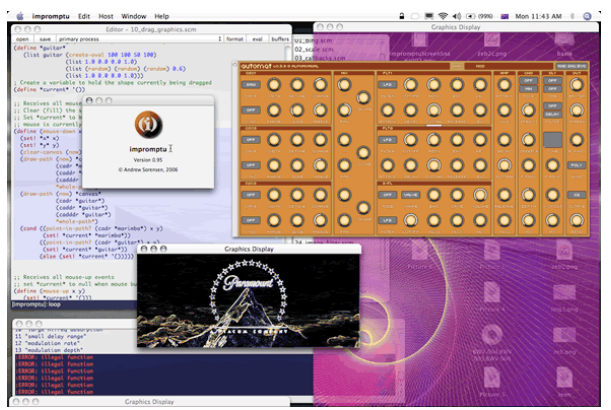
Figure 1. The Impromptu development environment

This is, for us, one of the most interesting aspects of our performance practice. The programmer is intimately involved in not only defining the process (as in standard computer music programming practice) but also in controlling its execution and evolution.